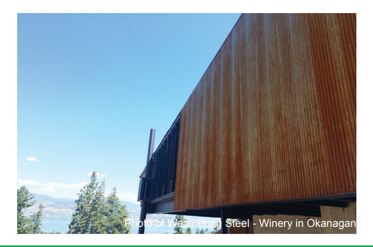
NEW: Cascadia Tex™

Cascadia Metals is proud to announce our newest product offer...Cascadia Tex^{TM} . Cascadia Tex is our trademarked pre-painted carbon steel product coated with a cutting-edge texturized paint system. This coating is known for its durability in extreme conditions and provides strong resistance to scratching, chalking, fading and weathering.